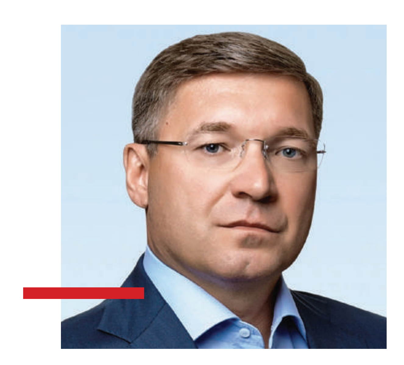
VLADIMIR YAKUSHEV MINISTER OF CONSTRUCTION, HOUSING AND UTILITIES OF THE RUSSIAN FEDERATION

The Russian Federation is going through housing construction reforms, and the task of the PROESTATE Forum is to make this process as flexible as possible for the industry.