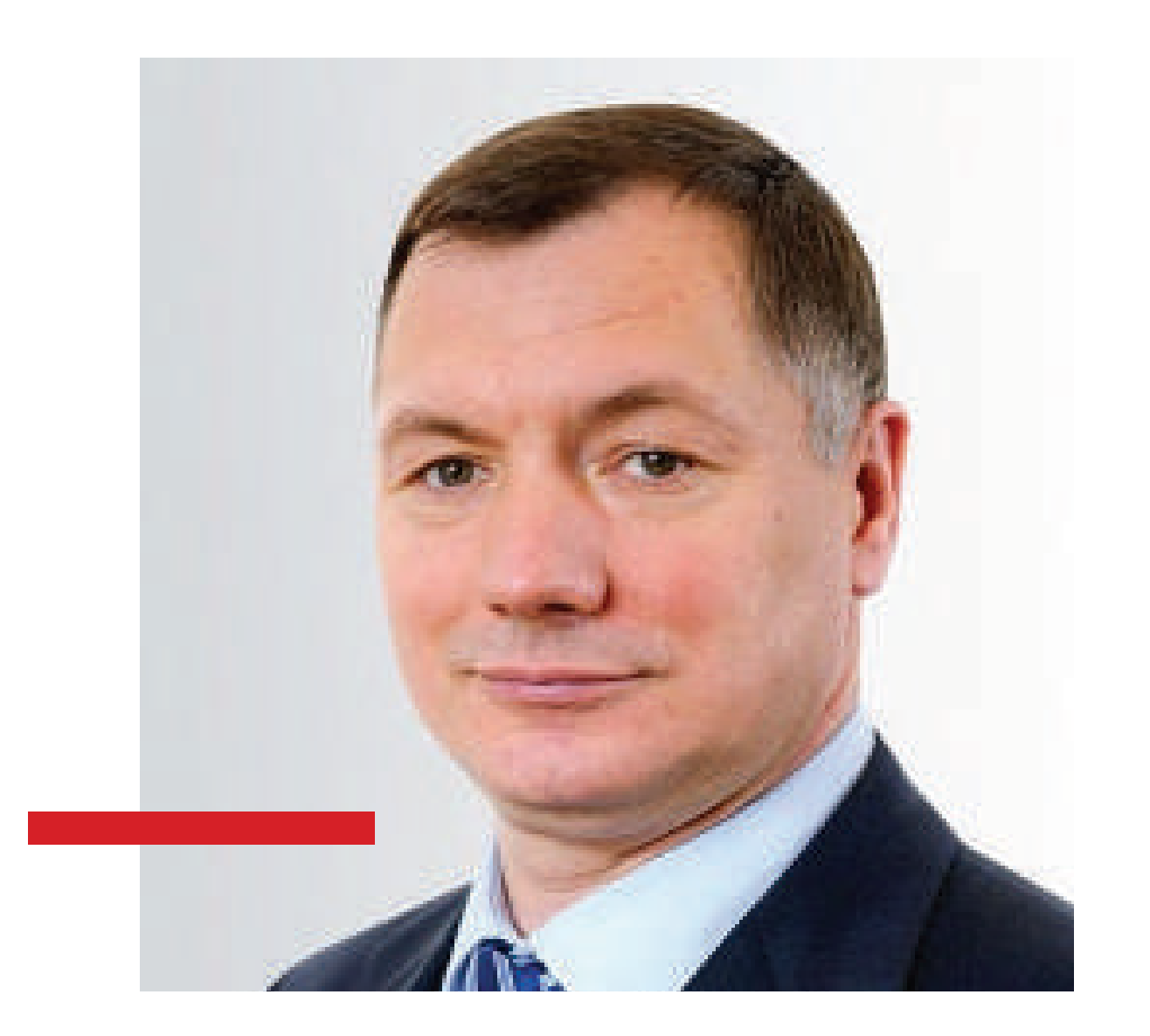
MARAT KHUSNULLIN DEPUTY MAYOR IN MOSCOW CITY GOVERNMENT FOR URBAN DEVELOPMENT AND CONSTRUCTION

The Russian Federation is going through housing construction reforms, and the task of the PROESTATE Forum is to make this process as flexible as possible for the industry.