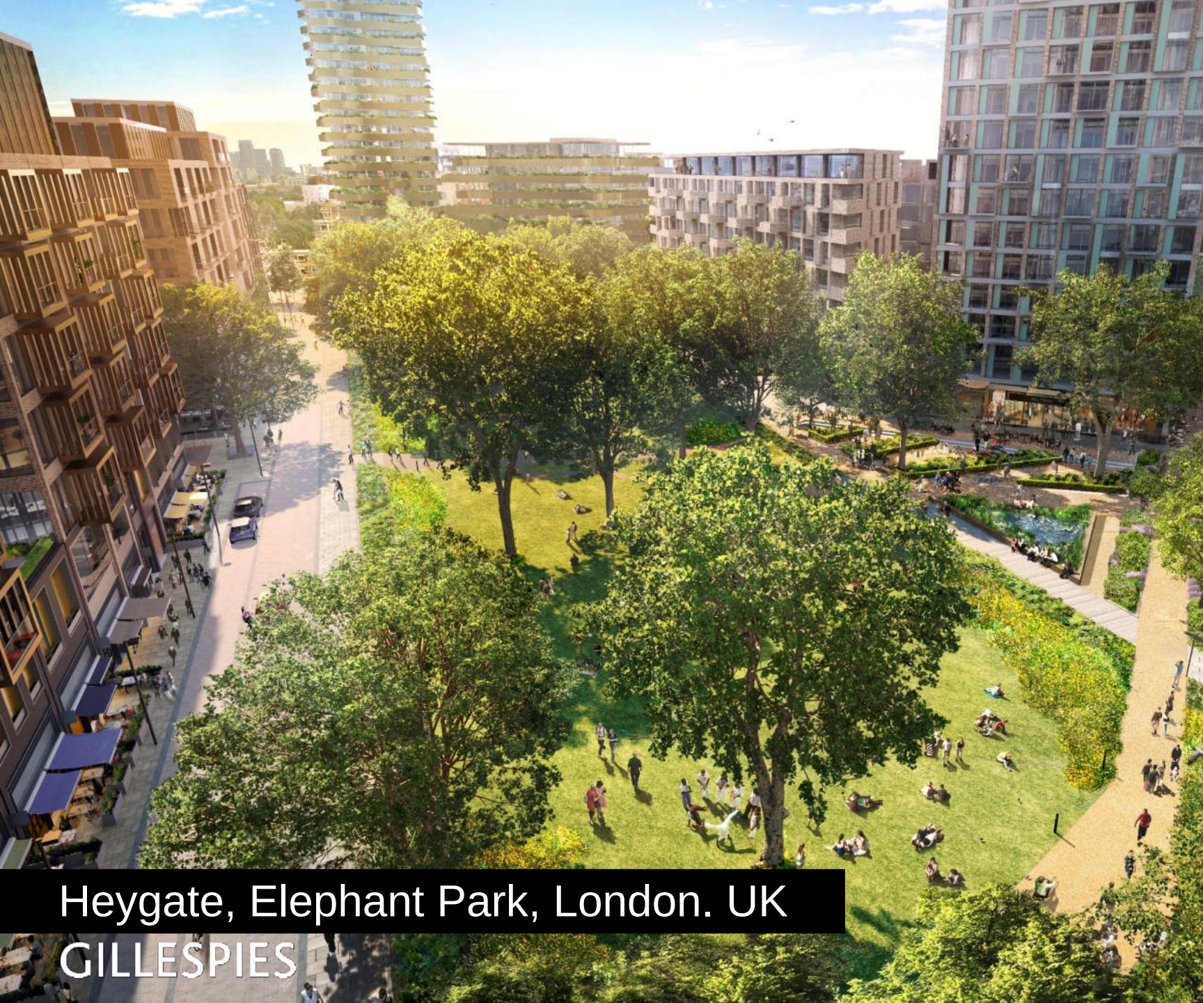
Heygate, Elephant Park, London. UK