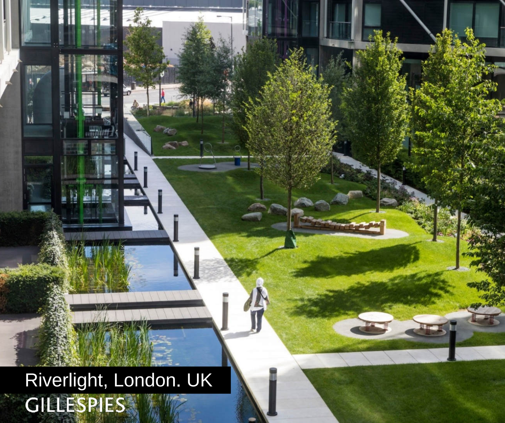
Riverlight, London. UK GILLESPIES