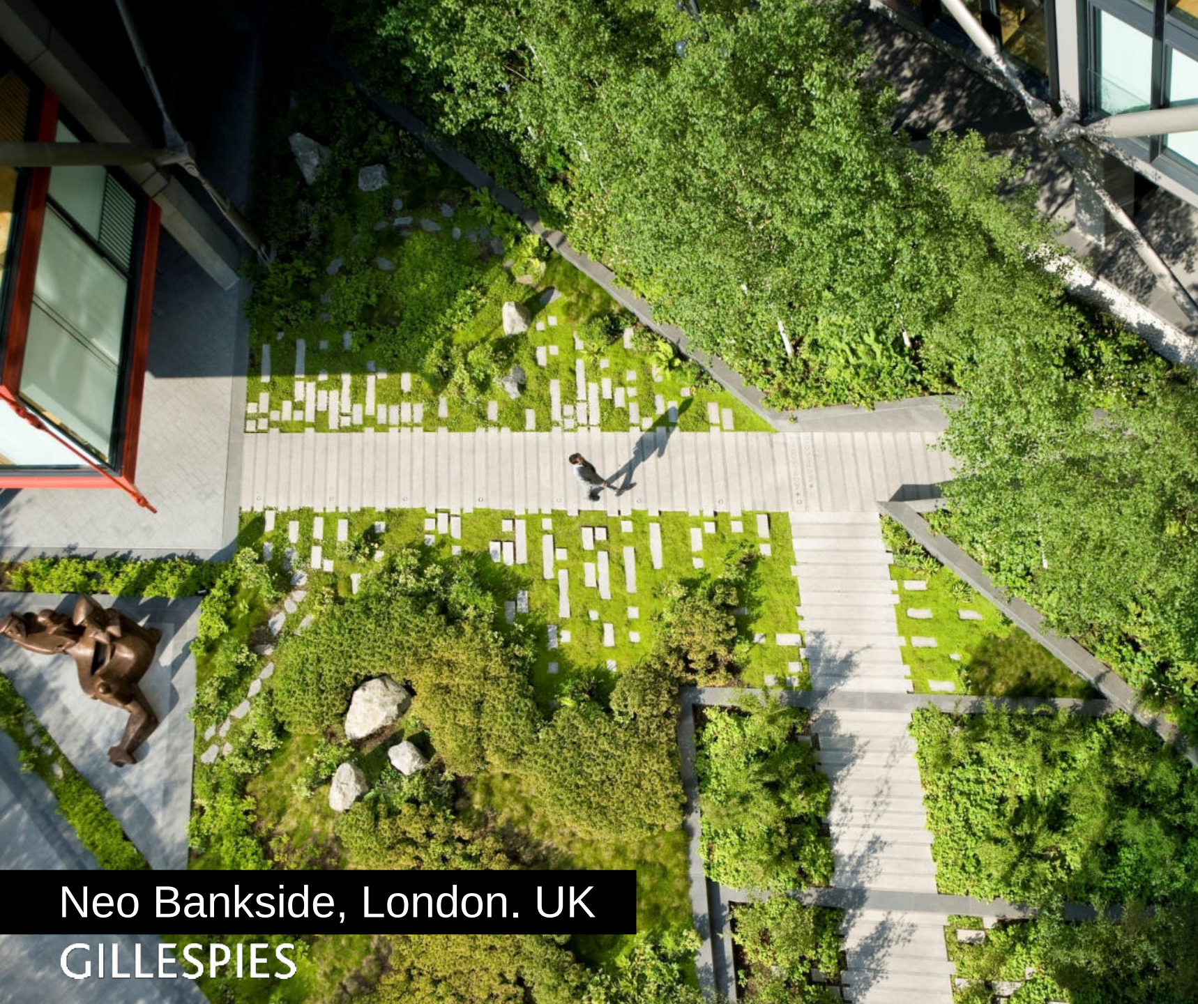
Neo Bankside, London. UK GILLESPIES